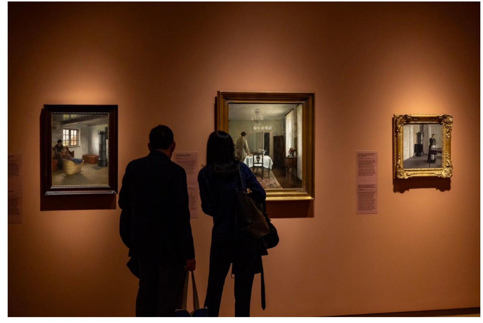
The Art of Work: Painting Labor in Nineteenth-Century Denmark member opening.